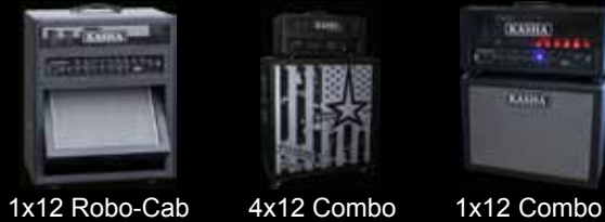
1x12 Robo-Cab 4x12 Combo 1x12 Combo

8 channel overdrive pedal was designed after the Rockmod sound that has been around since 1985 played by pros such as George Lynch, Jake E. Lee, Davey Johnstone, Dann Huff, Tim Pierce, Phil X, Paul Jackson Jr. and so on... With the advancement of analog micro technology, Kasha Amplifiers was able to design an overdrive pedal with the characteristics of a boutique amplifier. The results are mind blowing with so many possibilities of textures, gain and volume to choose from. This pedal is one of the few overdrives in the market that will work for guitar and bass and many other musical instruments.