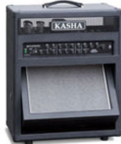
RI12C (Robo-CAB Combo 50 or 100W)