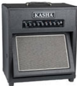
RB-12C (Rockmod Brick Combo)