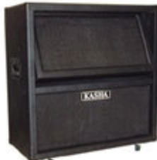
R412 (4x12 Robo-CAB)