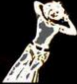
Powder new Video - FUNNY GIRL

See Powder's new video on Youtube "Funny Girl" http://www.youtube.com/watch?v=CY2oEUtqeCE