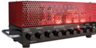
RB-01 (Rockmod Brick Pre-amp/8W Power Amp)