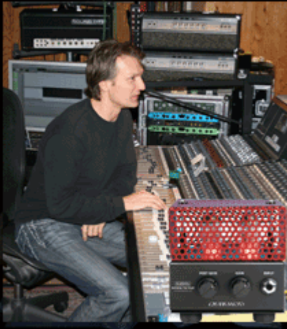
Studio Engineer (American Rejects, Buckcherry...)