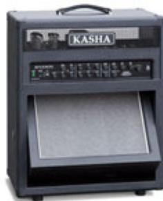
R112C (Robo-CAB Combo 50 or 100W)