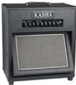
RB-12C (Rockmod Brick Combo)