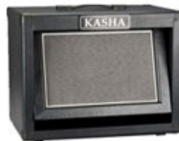
R112 (1x12 Robo-CAB)