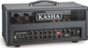
RM50HD and RM100HD (Rockmod Head 50W or 100W)