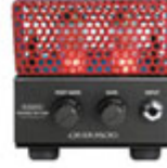
QM-C (Quikmod Classic)