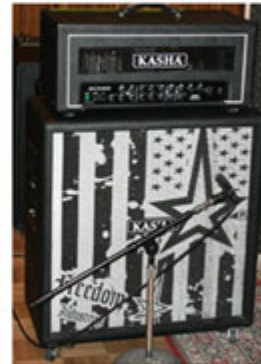
Phil X Freedom Rig (Phil X not included)